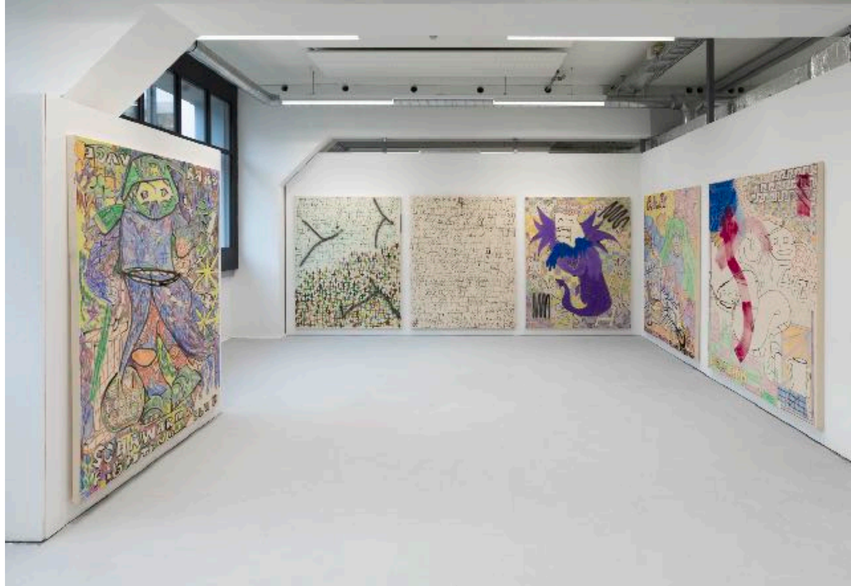
Untitled Oil, Acrylic and Pastel on Canvas, (2022), 200x160 cm. Series of six paintings