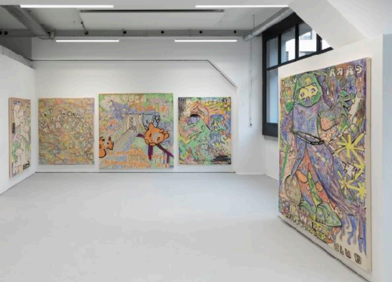
Untitled Oil, Acrylic and Pastel on Canvas, (2022), 200x160 cm. Series of five